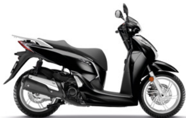
Pearl Nightstar Black