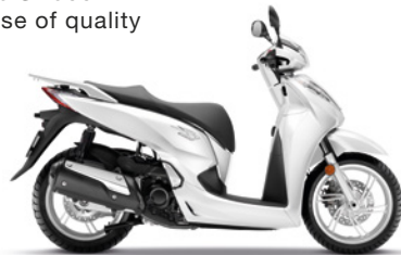
Pearl Cool White

Available in a choice of three stylish colours, the SH300i exudes a high sense of quality and prestige.