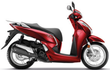
Pearl Siena Red