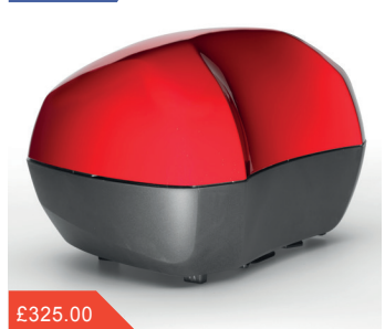
31L Top Box