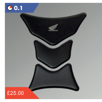
Tank Pad (Carbon-fibre) 08P61-MEJ-800

Hugger 08F70-MJM-D10 Protect your bike's shock absorber from dirt splashed from the rear tyre with this Hugger mudguard.