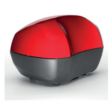
31L Top Box (45L in Travel Pack) A colour-matched Top Box offering capacity to store one full-face helmet and more. Featuring a locking, quickdetach mounting system, double link hinges and integrated seals.