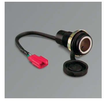
12V Electrical Socket Power additional electric equipment with this handy 12V DC Socket Kit. Quartet Harness included.

Please note: All prices include VAT but exclude fitting.