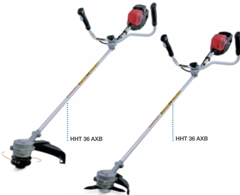
HHT 36 AXB