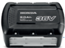
36V 9.0Ah DPW3690XA