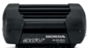
36V 4.0Ah DP3640XA