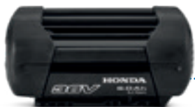
36V 6.0Ah DP3660XA