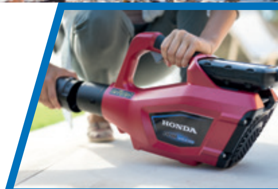
HHB 36 AXB