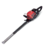
HHB 36 AXB