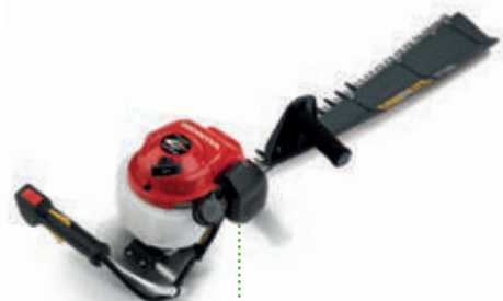
HHH 255 75 E