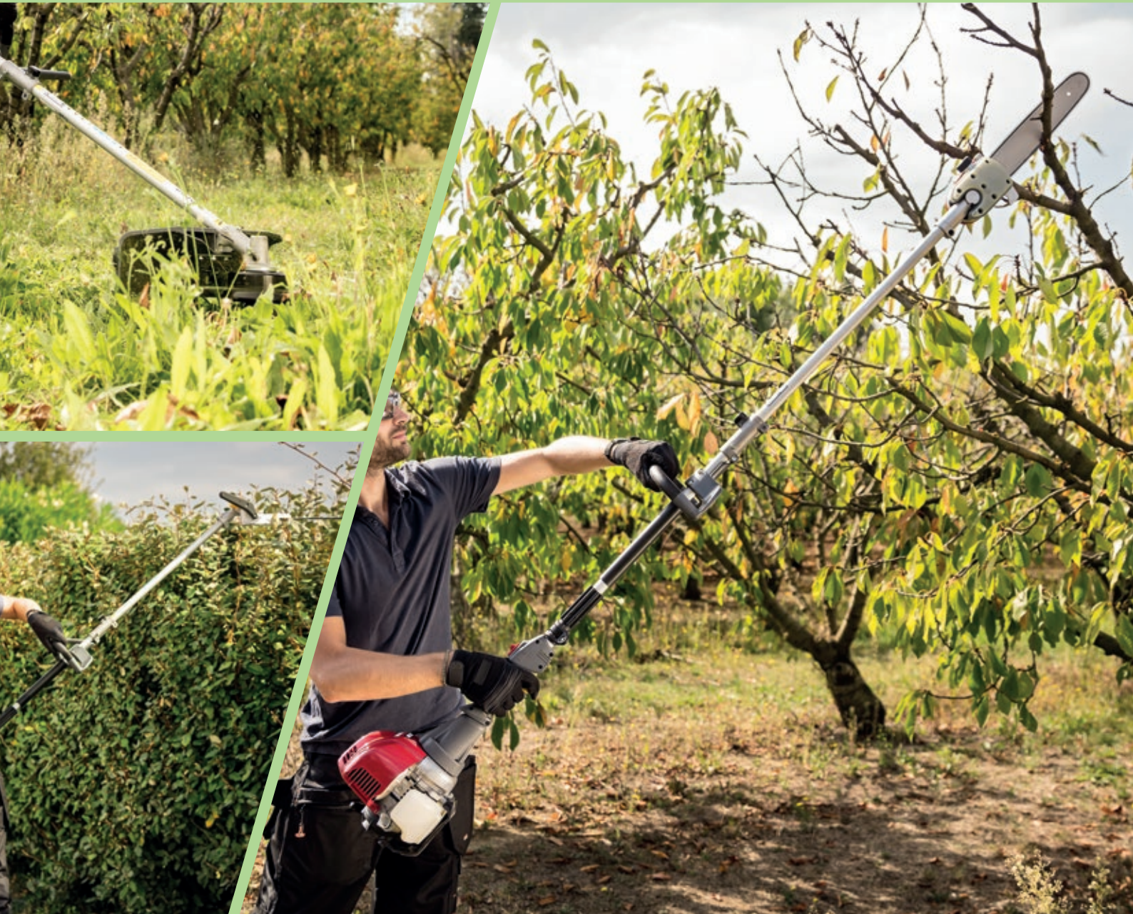
Change your tools in one click