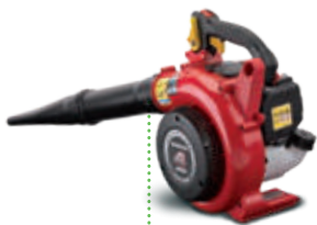
HHB 25 E

The airflow can reach 600m 3 /h which allows it to blow heavy and wet debris. Its cruise control feature allows you to maintain the engine speed without having to hold the trigger – great for using it over long periods of time. The Honda micro engine is designed to run smoothly with very few vibrations and low noise, whilst its mechanical decompression design offers easy starting. A 360° lubrication system allows you to work and store the machine in any position.