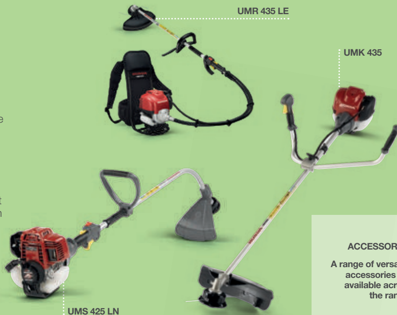
UMR 435 LE

Choose from our complete range, including a backpack brushcutter which has been designed to be highly manoeuvrable and comfortable. Or there is our bent shaft brushcutter, which comes fitted with the tap and go nylon head and is designed to reach really tricky areas.