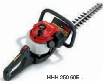
HHH 250 60 E