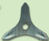
3 tooth blade