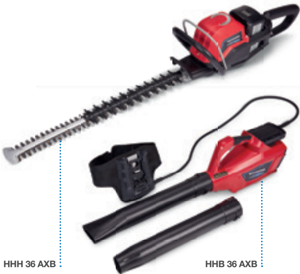
HHH 36 AXB