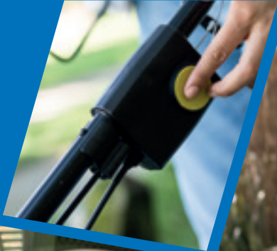
Easy start push button