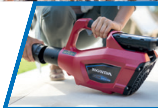
HHB 36 AXB