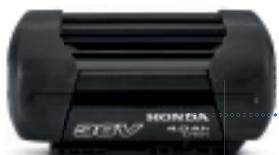
36V 4.0Ah DP3640XA