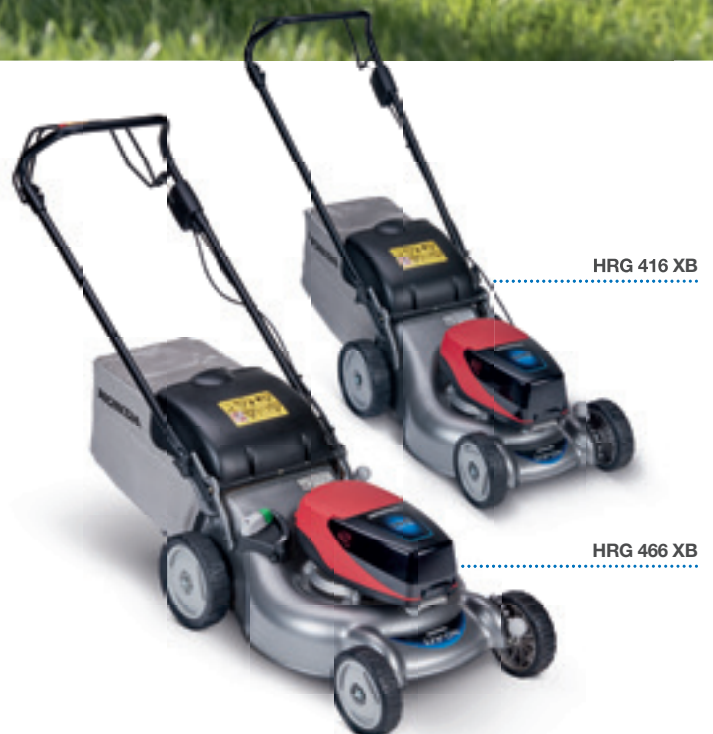
HRG 416 XB

Built to avoid clogging and reduce maintenance, it includes a high-air flow collection bag to maximise pickup, flexible cutter height adjustment and Versamow™ Selective Mulching*, so it can adapt to any gardener's needs. Certified to IP54 for weatherproof, it lets you cut wet grass in complete safety. You don't even need to stop if it rains.