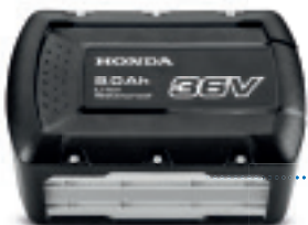
36V 9.0Ah DPW3690XA