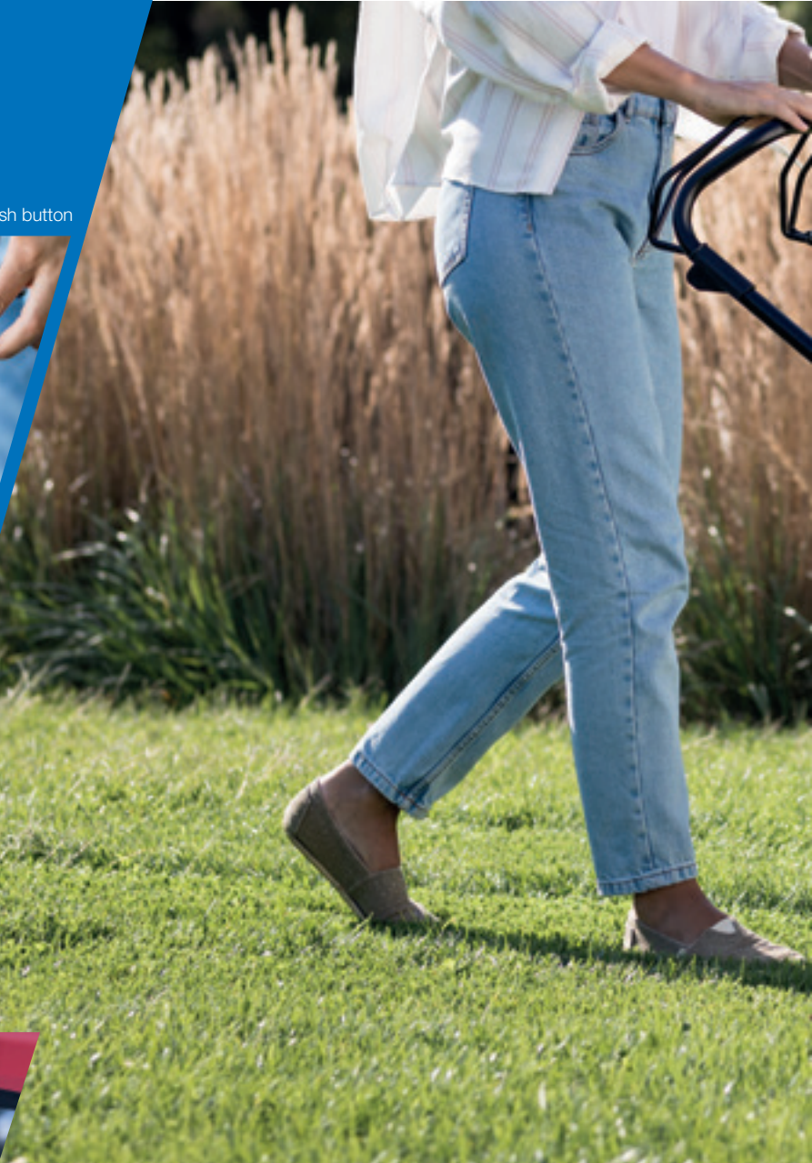
Versamow™ Selective Mulching