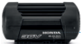
36V 6.0Ah DP3660XA