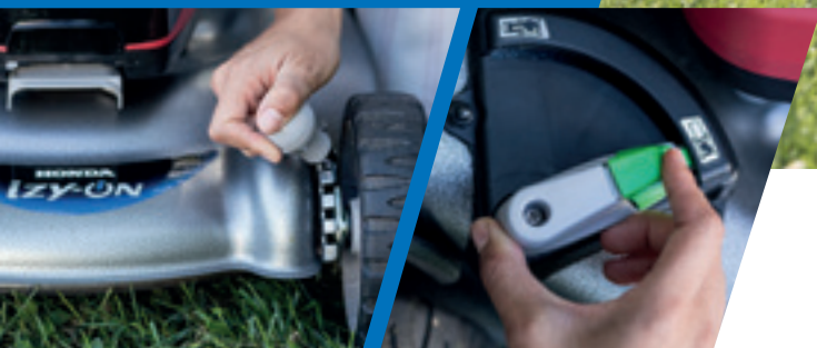
Cutter deck height adjustment