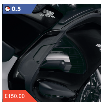
Fairing Deflector Set 08P73-MCS-800A

Protect the front corners of your pannier lids from knocks and scratches with these black polyurethane pads. They can be painted to colour-match your bike.