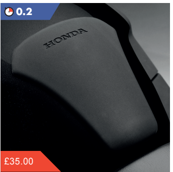
Tank Pad 08P61-MCS-800

A set of two black polyurethane armrests installed on the right and left side of the Top Box lid to increase pillion comfort.