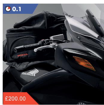
28L Tank Bag

A set of two black pannier-shaped inner bags that can be combined as one. Each bag offers 16L of carrying capacity, has an expandable front pocket and includes an adjustable shoulder strap.