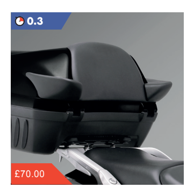
Pillion Armrest Set 08U91-MCS-800

A 28L Tank Bag featuring 3 horizontal compartments with a map holder in each for more efficient carrying and includes a rain cover and waist bag.