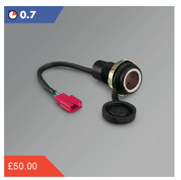
12V DC Socket Kit 08V70-MCS-800

A black polyurethane Tank Pad that will help to protect the fuel tank from scratches.