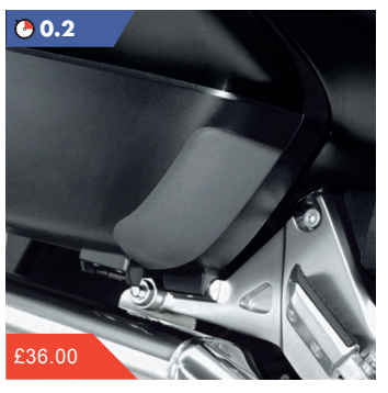
Pannier Scuff Pad Set 08P76-MCS-800

A colour-matched spoiler with an integrated LED Stop-light to add some sporty style to your Top Box. Must be combined with LED Stop-light Harness.