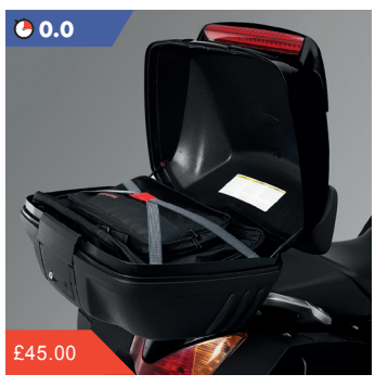
45L Top Box Inner Bag 08L56-MY5-800

A colour-matched Top Box offering 45L of carrying capacity to store two full-face helmets and more. Shown with Pillion Armrest Set.