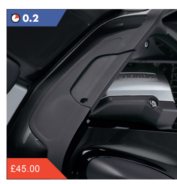
Knee Pad Set

A set of left and right black polyurethane deflectors that fit to the mirrors and extend the amount of wind protection for both rider and pillion. They can be painted to colour-match your bike.