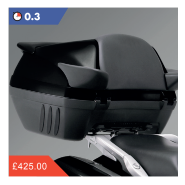
45L Top Box 08U70-MCS-G40ZE

A colour-matched Top Box offering 45L of carrying capacity to store two full-face helmets and more. Shown with Pillion Armrest Set.