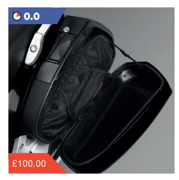
Pannier Inner Bag Set 08L56-MCS-A00

Carry your day to day necessities with this black nylon bag with a silver Honda Wing logo on the front. Expandable from 21L to 33L, it has a front pocket that will hold an A4-size file, adjustable shoulder strap and carrying handle. A grey version is also available.